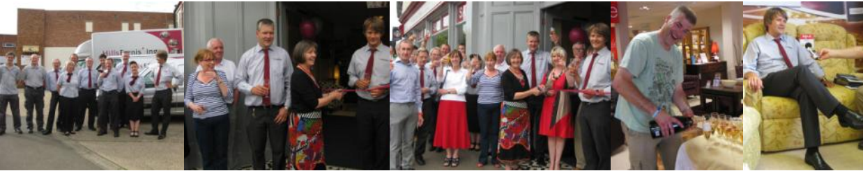
Recently the historic façade of Hills Furniture Store in Bridge Street, Spalding, was the subject of a major refurbishment partly funded by a grant from English Heritage. Tulip Radio went along to the grand reopening.